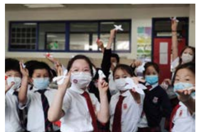
Dulwich College, Suzhou, China

“ We don't know what the future holds, so we must make this work... education is too important.