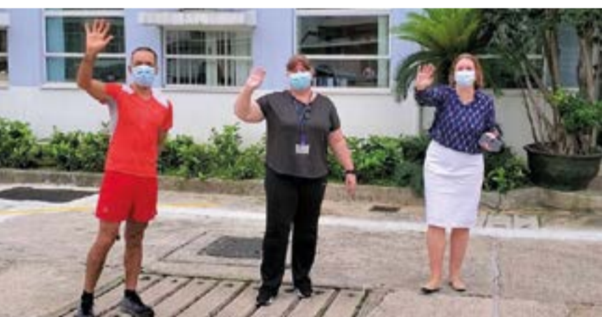
Sha Tin College, Hong Kong

well – they have a school laptop and most students are used to doing work online. The problem has been not getting to interact in person. There are some good platforms such as Zoom's breakout room feature, but this does not compensate for the lack of human interaction. Overall though, I have found this experience has really highlighted just how adaptable students can be. I found my students online ready to learn and complete their work. Even when it came to past paper questions they all completed them and were really keen for feedback. By sharing best practices with other teachers I have been able to keep my lessons varied and that in turn has helped keep students engaged. Sharing has also helped to make what could be a lonely experience much more fun and engaging. I am looking forward to getting back into the classroom and I know that I will definitely be getting students to put away their laptops for a while! But I feel like everyone will come out of this with a much stronger sense of school community. I also feel schools will become more streamlined as they have seen the benefits of staff being freed up to focus on teaching, planning and working together.